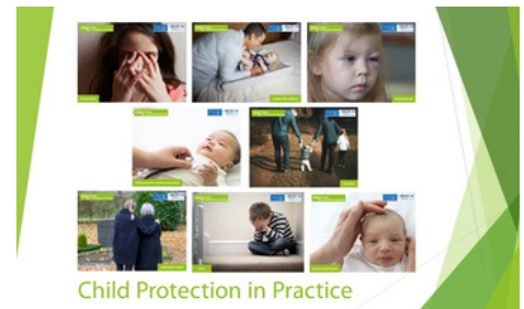
Child Protection in Practice

The nationally recognised online course provides competencies required for ongoing child protection practice. The modules are mapped directly to the RCPCH HST core competencies at level three and candidates have the flexibility to choose the modules that best meet their specific training needs.